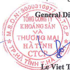
Le Viet Thao